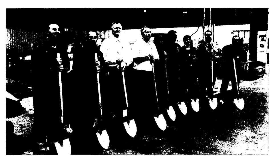
Groundbreaking for ATEC Steel Office Addition - June 26, 2015

Responded to a request from Calibrated Forms for assistance in securing the Folder Express plant in Columbus. Provided data on the regional workforce, connected company representatives with the Kansas Department of Commerce and City of Columbus, and provided other information and assistance to facilitate Ennis' decision. The relocation of Folder Express to Columbus represents up to 85 new jobs and $6.5 million in capital investment.