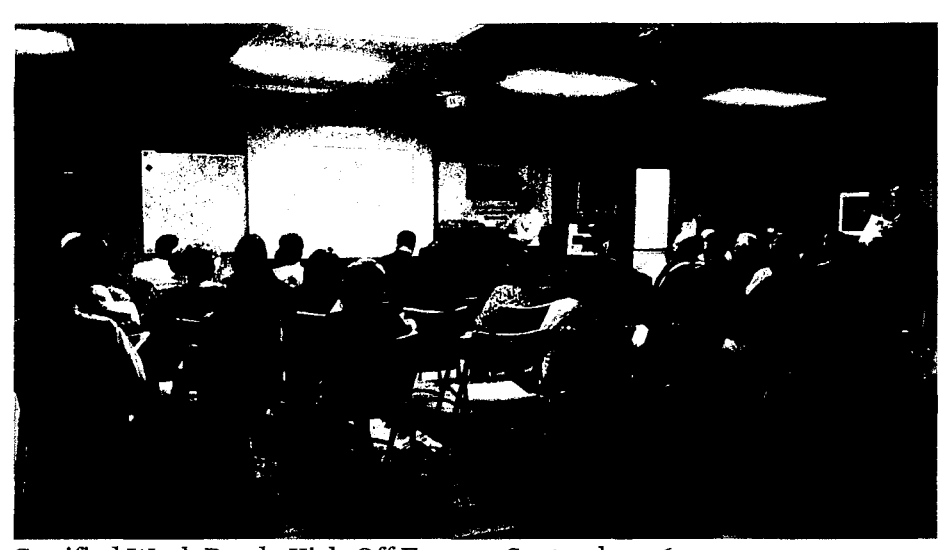
Certified Work Ready Kick-Off Event - September 16, 2014